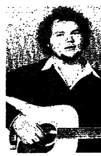
Cross: "If I sing about the birds in the trees and I'm so pleased, well, I am pleased."

PARIS — Christopher Cross is an outrageously content, ingenuously frank man who seems younger than his 29 years and who, with his countertenor tenor, gollys and gee whizzes reminds you of old Ronald Reagan roles and the characters in the film "The Deer Hunter" before they